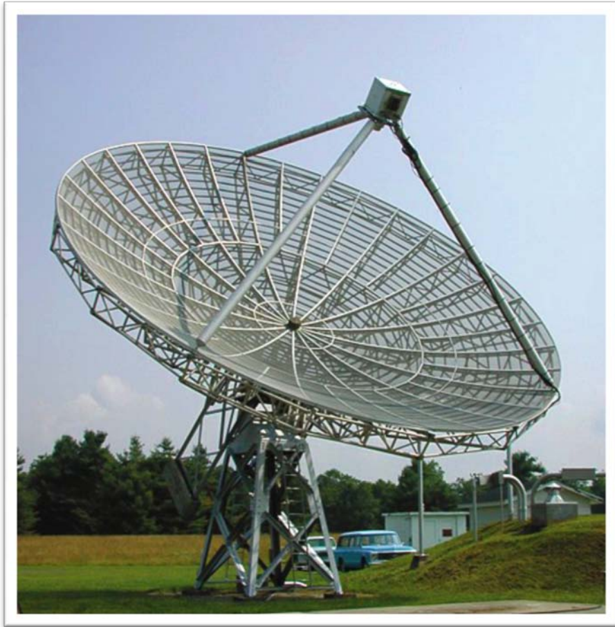
The 40 Foot Radio Telescope